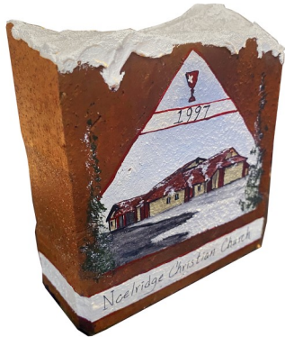
Above: Souvenir hand-painted portion of brick created by Jealee Weber depicting the new NCC facility.