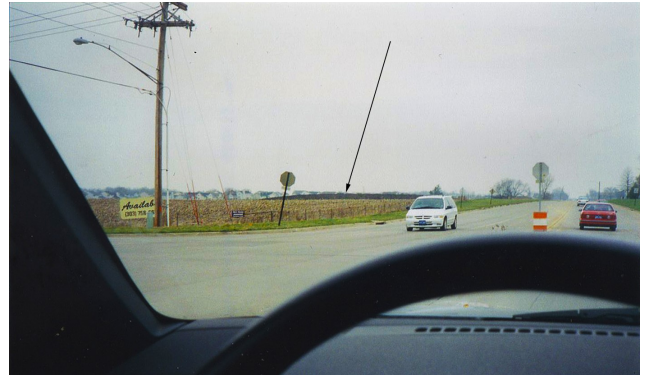
Looking north from C Avenue at Boyson Road NE in early 1997. Graded ground for the future NCC facility is indicated by the arrow. Today, the Marco's Pizza delivery store is located where the "Available" sign is shown at left.