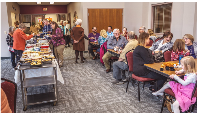
Harvest Dinner in Fellowship Hall, following the NCC Sunday worship service on November 13.