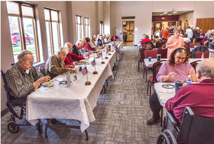
Harvest Dinner in Fellowship Hall, following the NCC Sunday worship service on November 13. At left are the NCC veterans who were being honored on this day.