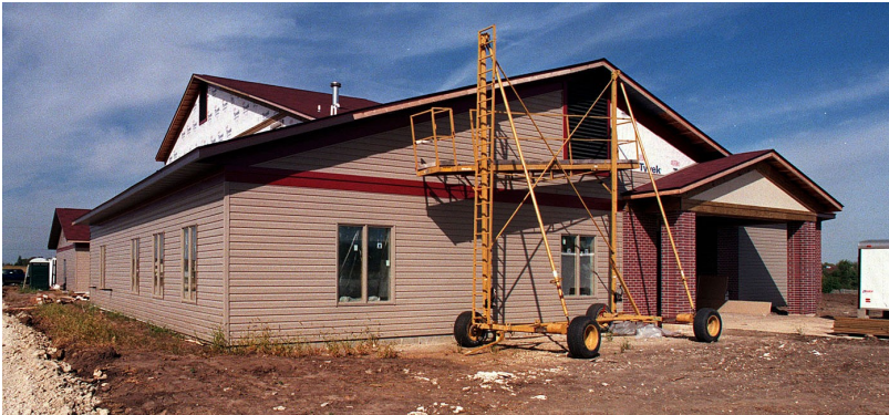
NCC is shown under construction on October 1, 1997. The first Sunday worship service in the new facility was held on November 30.