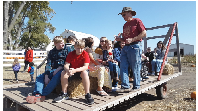
Below: NCC Praisebuilders and Godsquad youth are shown on a haywagon ride at Bart's Pumpkin Farm on Sunday afternoon, October 9.