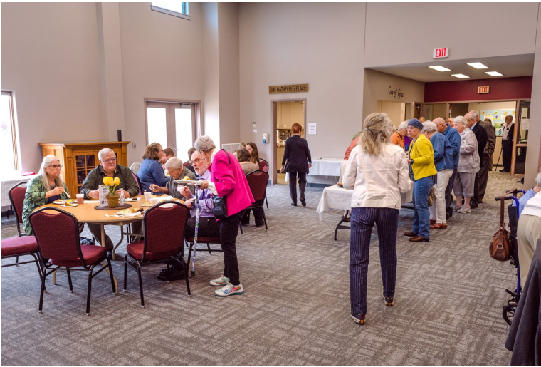
Above: Diners attend the Potluck in the Fellowship Hall on April 30.