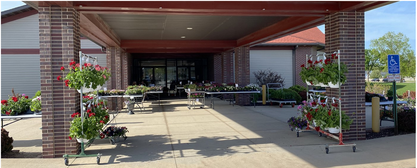
Flowers and plant inventories are shown from NCC's front entrance on the first day of the church's Plant Sale. The sale ran from Wednesday, May 10, to Saturday, May 13.