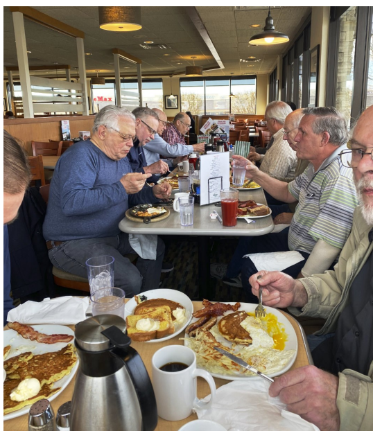
The NCC men's monthly breakfast was held at Perkins restaurant on Collins Road NE on Saturday morning, March 16.

A search team is being formed. When that process is complete, the team names will be made public and we will begin the process of gathering potential interim names and discussions with candidates. The interim is usually a 18-month to two-year process. As Noelridge embarks on this new chapter, continue to hold the church in your prayers. We seek God's direction in our path. Know that we will be guided as God calls a pastor to serve Noelridge. We will continue to worship God, bring people to Christ, and serve our church and community.