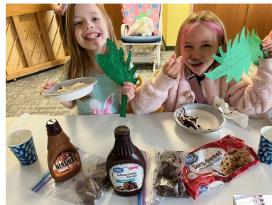
Children make “Palm Sundaes” on Palm Sunday.