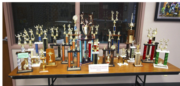
A trophy table is shown in front of NCC's library on Sunday, March 10. The trophies were being cleared from the storage areas and were offered to congregational members to take home. The trophies represented volleyball, softball and basketball sports and ranged in dates from 1962-2006. On the volleyball side there were 8 first place trophies, 5 second places and 1 third place. For softball, there were 3 first place trophies, 2 second place and 2 third place. For basketball, 1 first place trophy.