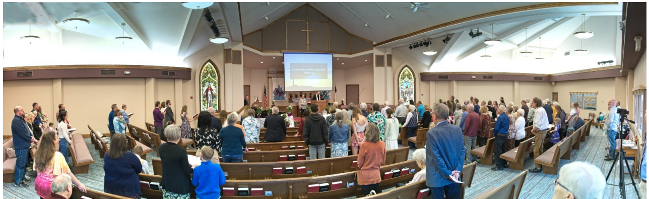
The NCC sanctuary during the Easter Sunday service on March 31. About 145 people attended the service.